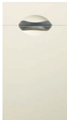
Curved Pull Handle