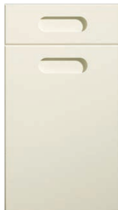
Inset Routed Handle