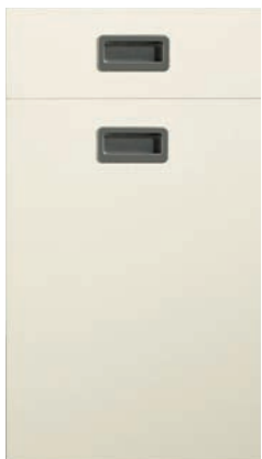
Inset Pull Handle