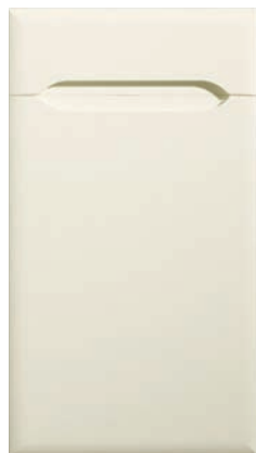
Long Crystal Handle