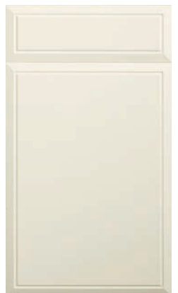
Bevelled Cove On Edge

All these door designs Any size & any colour