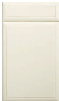
Art Decor T&G On Edge