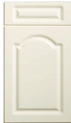
St Pauls Cathedral