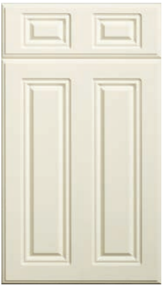
Westminster Twin Panel