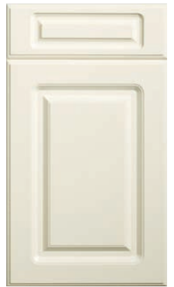
Alpine Trafalgar Square