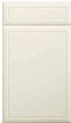
Art Decor Cove On Edge