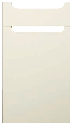
Long Scoop Handle