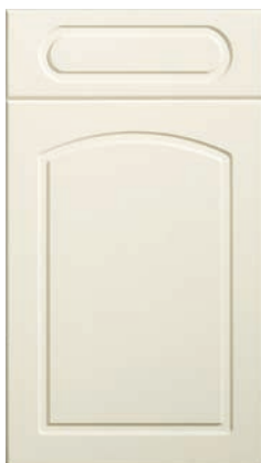
York Roman Arch